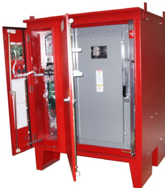
MP600 Fire Pump Controller