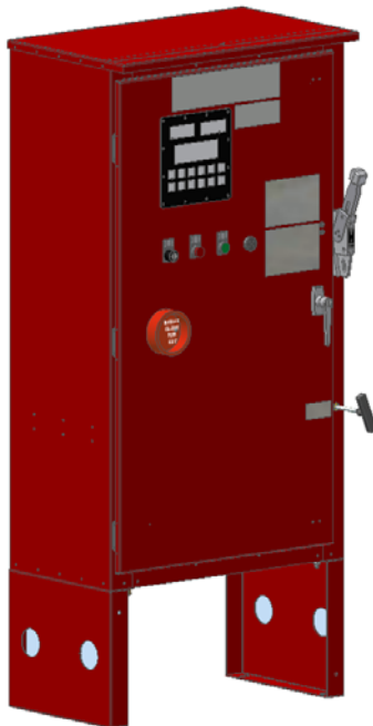
MP300 Fire Pump Controller